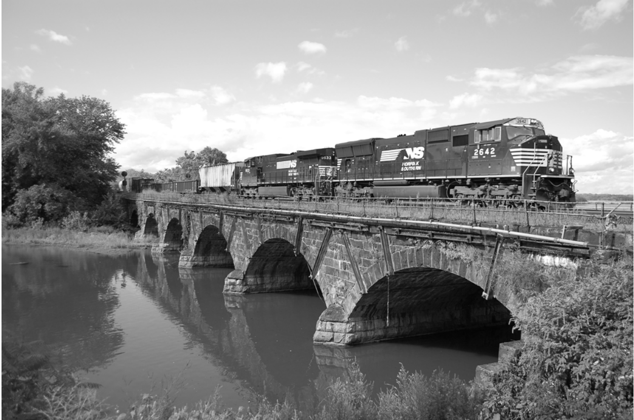
A NS freight heads south over Sherman Creek Viaduct

If you head up north along Route 11/15, you will reach a great little six arch stone viaduct over Sherman's Creek – a tributary to the Susquehanna River. You will have a clear view up and down the rail line to let you know when trains are on the way.